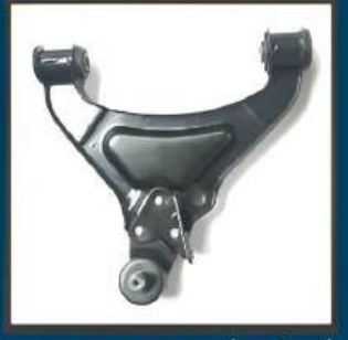
Lower arms now in stock