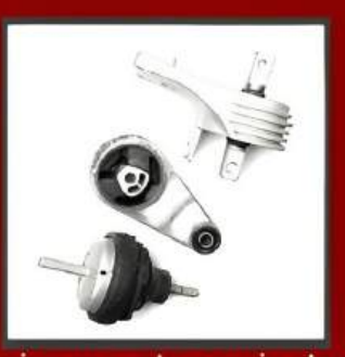
Engine mounts now in stock