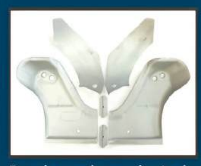
Repair panels now in stock