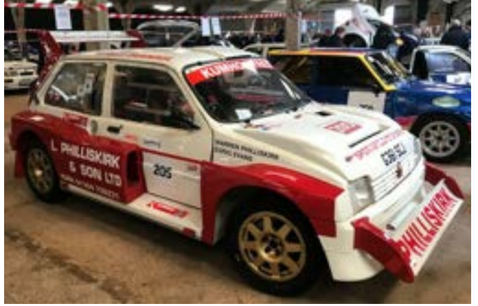
Tickets are available in advance from £29.50 or on the day from £32.50. Find out more at: www.raceretro.com

Not everything at the event is static, the outdoor action features Rallying with Group B and includes two Live Rally Stages with over 120 ex-works and WRC cars showing what they're made of. Plus, you can experience a passenger ride in one of these cars.