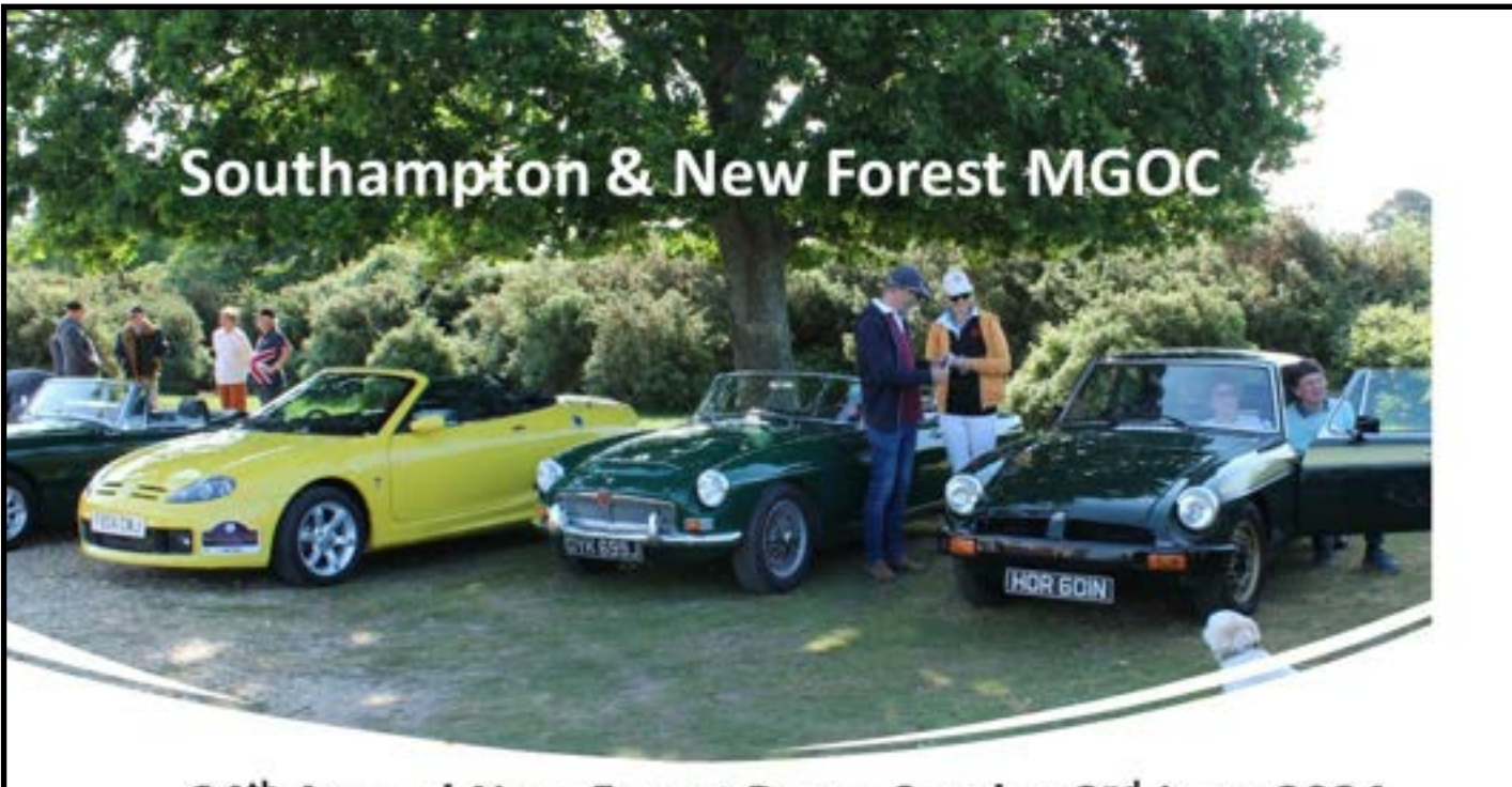
24<sup>th</sup> Annual New Forest Run – Sunday 2<sup>nd</sup> June 2024

For full details & download entry form: https://www.1009mg.org.uk/new-forst-run-2024/