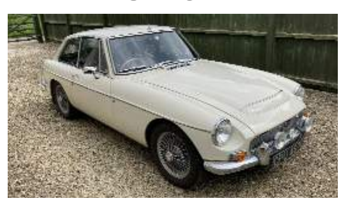
1968 MGC GT

White with refurbished interior black upholstery with white piping and walnut fascia and Motolita steering wheel Condition 3, 62,000 miles, MOT to 01 May 2025 New headlights and bulbs, additional 12v power socket (for sat-nav etc) and new 6v batteries.